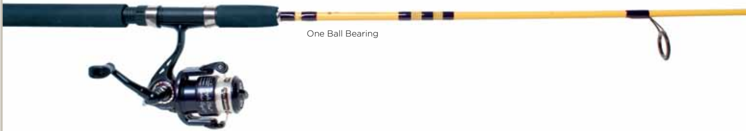
One Ball Bearing