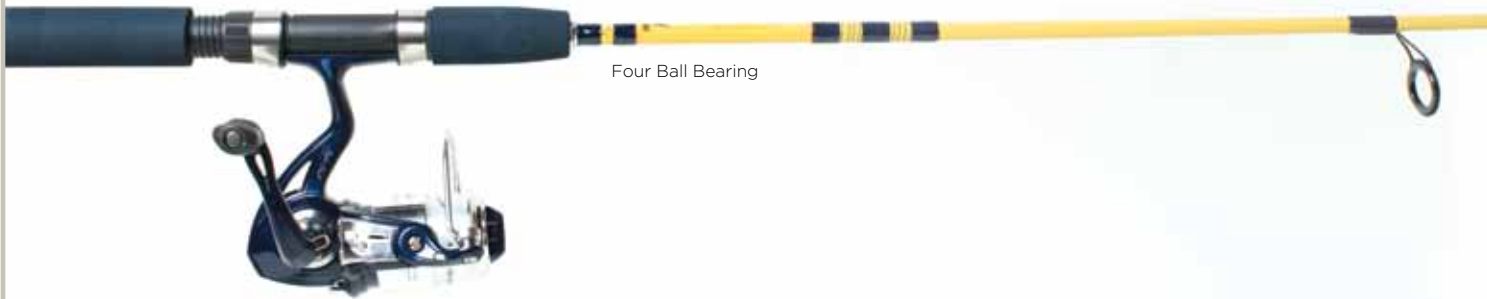
Four Ball Bearing